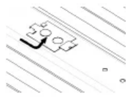
Fig. 1 · Wiring cover & terminal block