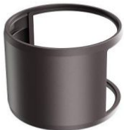
Light Spill Shield