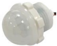
Optional PIR Sensor