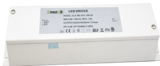
NON DIMMING IP20