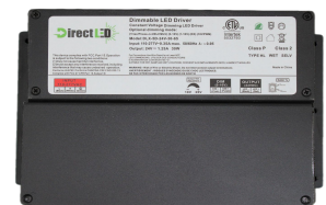
UNIVERSAL DIMMING IP67